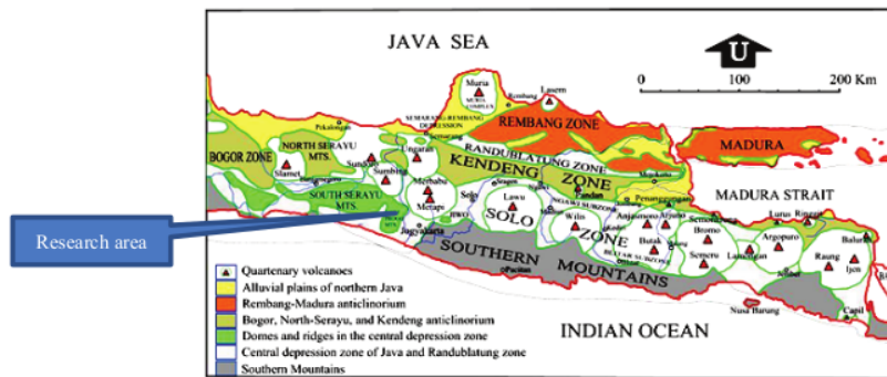
Figure 1. Research area in physiographic map after Van Bemmelen (1949).

Denudation is that group of processes which, if continued far enough, would reduce all surface inequalities of the globe to a uniform base level, usually sea level. In this context, the main process is degradation. This process involve the disintegration of rock (weathering) and the stripping of loose, weathered material from the earth surface by various processes of erosion and mass wasting (Van Zuidam, 1983).