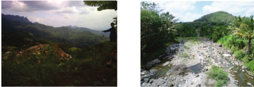
Figure 3. Landform of research area, in Gleoran /Loc 19 (left) and at Kedunggrong /Loc. 1 (right).

rocks of Nanggulan, Dukuh, Sentolo and Jonggrangan Formations. The landform of course, influenced by these physic condition of rocks as well as many processes in the area.