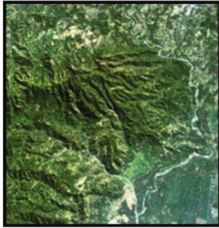
Figure 2. Morphology of research area showed from Landsat image band 321 in 1995 (Budiadi, 2008).

To know about morphological characteristics of the area, some response variables of morphometry have been analyzed, include : (a) elevation (h); (b) slope ( \alpha ); (c) valley floor – height ratio (Vf); (d) valley cross section (Vratio or Vr); (e) river gradient index (SL); and (f) drainage density (Dd). These variable responses have been collected from field directly as long as geomorphological mapping. The principle understanding of them can be noticed at Table 1.