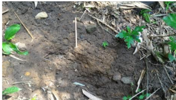
Figure 4. Aquifer of andesite breccia yields Degan spring.

Degan's spring appears on the young Merapi breccias aquifer. These rocks are black, clastic textures, gravel-boulder grain size fragments, medium sand sized matrix, open pack, massive structure, supported by composition of andesite fragment, while the matrix is sandstone (Fig. 4). In this weathered conditions, rocks are brownish, non-compact, porous and permeable so they are excellent as groundwater aquifers.