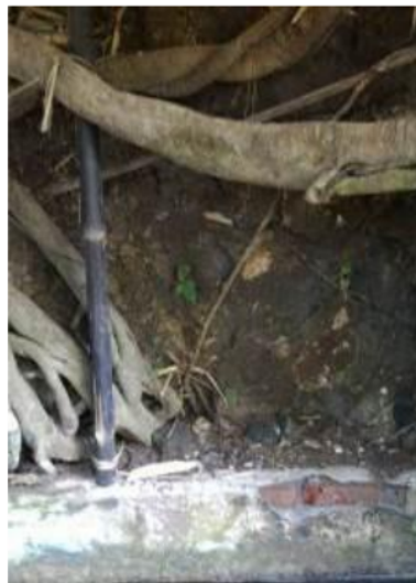
Figure 8. Tuff of the Old Andesite Formation exposed in Dukuh, has been weathered so that it is blackish brown, relatively soft and porous.