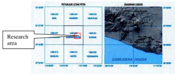
Figure 1. Research area in Topographic Map of Sendangagung [1].

Water is a very vital and strategic need, therefore water must be maintained in adequate quantity and good quality.