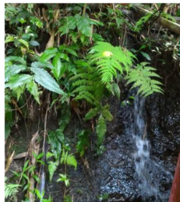
Figure 9. Andesite breccia of colluvium sediments found at Degan II Village.