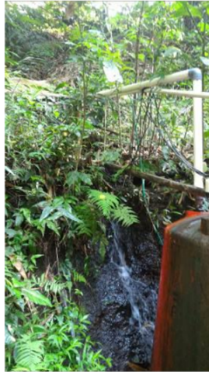
Figure 3. Degan spring at Degan II, Banjararum Village.

The water emerging from Degan's spring is clear, colorless, tasteless and odorless. Groundwater is very well used for drinking water or daily living purposes.