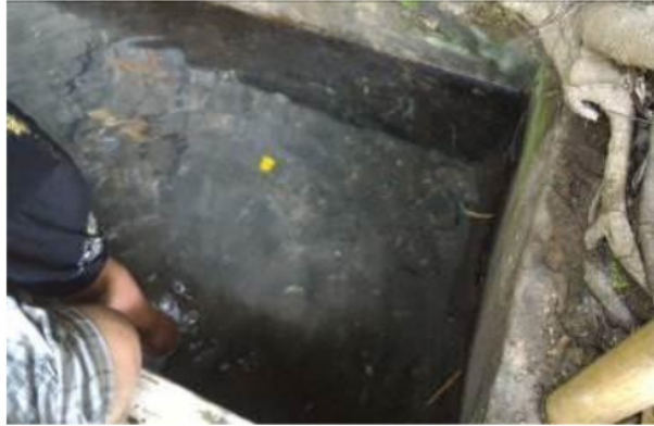
Figure 5. Dukuh spring which be constructed by concrete.

water is used by the people for everyday purposes.