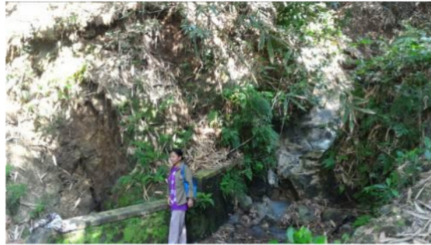
Figure 7. The other spring at Dukuh near the spring where the isotope sampling have been taken place.