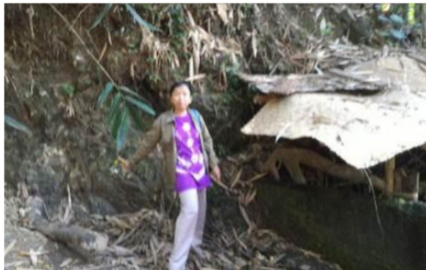
Figure 6. Tuff of Old Andesite Formation aquifer that produces Dukuh spring. Groundwater samples for isotope testing are taken from this spring.

The Dukuh spring appears on the tuff aquifer of the Old Andesite Formation (OAF). There are two adjacent springs in this area, approximately 10 m apart. The appearance of this spring is supported by a topographic cut by looking at its position below the cliff path (Figure 6) as well as on the riverbank below a steep cliff (Figure 7). In addition, these springs are also controlled by the different permeability of rock contacts, ie between tuffs with autoclastic lava / breccias whose outcrops can be observed on the edges and bottom of the stream near the springs.