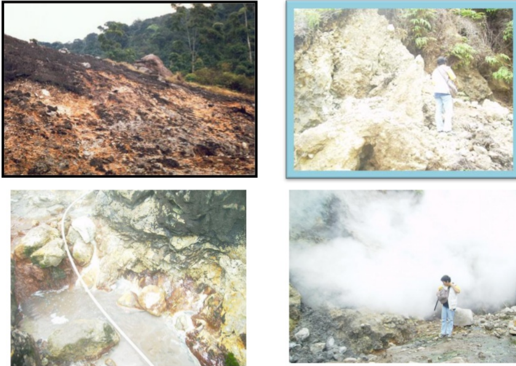
Figure 3. The alteration volcanic rocks at Gedongsongo area, show yellowish brown or black in color with sulfuric coating (upper). Alteration rocks around hot spring and fumarole (lower).

Around fumarole, there are some small hot springs with yellow sulfuric deposit. The alteration rocks usually located in river valley, yellowish brown to greyish black in color. Their alteration type usually include in argillitization type. These alteration phenomena occur in andesitic lava and breccia (Disbang Jateng – STTNAS, 2004). They can be obviously observed from the color and petrophysic. The petrophysic characteristic usually show soft, uncompacted, weathered condition of outcrops. Sometimes, the odor of sulfur strong smelled at the place surrounding the alteration rocks.