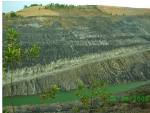
Figure 6. The out crop and overburden of mining at Tarugin Hill.

spottily distributed of calcopyrites. The weathered rocks usually show brownish red to reddish brown in color (Figure 6).