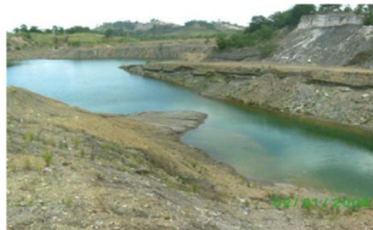
Figure 3. AMD pool appearance at Simpangempat Village.

Simpangempat was accumulated in pool approximately as large as 5000 m 2 . This mine water volume is estimated more than 25000 m 3 . The mining activities at this site still running, it means that mine water which will be produced much more so this AMD should be overcome.