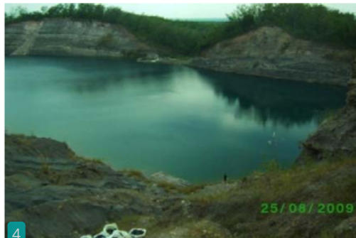
Figure 4. The pool of AMD located in Pakan Hill.