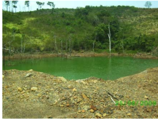
Figure 2. The storage pool of AMD at Tarungin Hill, has ± 2500 m 2 in size.

water volume is estimated more than 7500 m 3 and could be increase if there are heavy rainfalls. The mining activity still have run there, it means acid mine water will be produced much more than today.