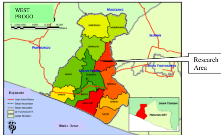
Figure 1. Research area in West Progo administration map [1].

3 influenced by the geological conditions in an area, for example in terms of the type of rock [4]. This groundwater chemical aspect will support hydrogeological research of a region. Hydrogeological research has been developed in various regions to assist the society for their water supply. Water is a very vital and basic needs, so that it must be kept in sufficient quantity and good quality.