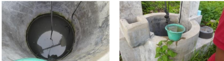
Figure 2. Well in Ngipikrejo, Banjararum has less quality of groundwater.

Field observation showed physical properties of groundwater as clear / colorless, tasteless and odorless, with low turbidity one. Ten locations has been sampled and only groundwater in Ngipikrejo that showed less transparent, slightly smelly and slight turbid (Table 1; Figure 2).