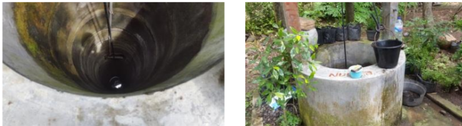
Figure 3. A well in Ngentak, Banjararum that has been sampled for chemical laboratory work.

Groundwater samples used for chemical laboratory analysis were taken in one well and three springs (Figure 3). The physical/chemical properties can be read in Table 2.